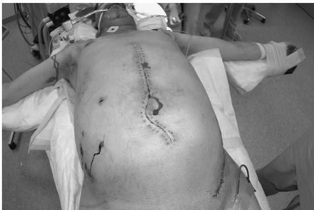
Figure 1. Patient with grossly distended abdomen and abdominal compartment syndrome

Patient following trauma with secondary intraperitoneal sepsis, grossly distended abdomen and impending wound dehiscence for a re-laparotomy.