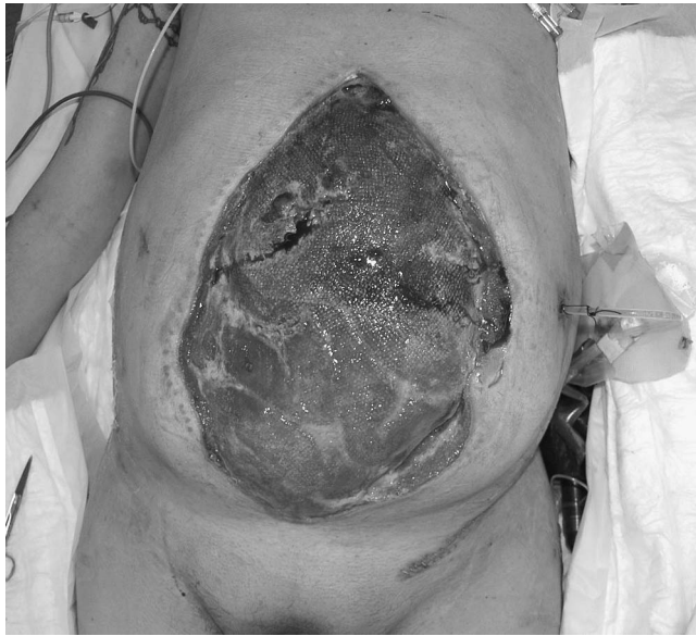
Figure 2. The open abdomen with a fistula