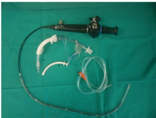
Figure 1: Conduits considered for tube exchange for a size 6 tracheostomy tube: size 5 ETT in size 6 tracheostomy tube, nasogastric tube and high-capacity fluid administration set tubing.

A 40 cm section of the HCFAS was passed over the FOS. The FOS was advanced into the trachea and the HCFAS tubing advanced over the FOS into the trachea. Tracheal position was confirmed by advancing the FOS again to visualise the tracheal rings. The FOS was then removed and a size 6.0 ETT then passed over the HCFAS tubing. Ventilation via the size 6.0 ETT was confirmed by bronchoscopy and capnography. Had passage of the 6.0 ETT failed, oxygen could have been insufflated by connecting the HCFAS tubing to a bag-valve resuscitator using a 5.5 ETT connector.