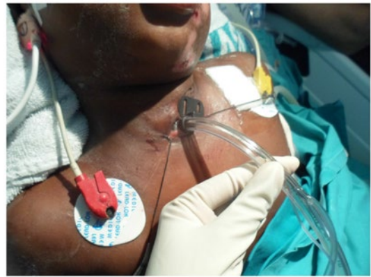
Figure 2: ETT secured with a modified cable tie.

The ETT could only be advanced into the neck incision so far as to allow cuff sealing. Any further advancement resulted in right endobronchial intubation. The 6.0 ETT was securely fixed with a modified cable tie, which is currently under development as a tube fixation device that minimised movement of the ETT (Figure 2).