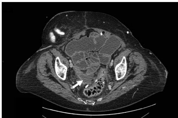
Fig. 1. Abdominal computed tomography scan performed on the fourth postoperative day revealing a 3-cm diameter fluid collection at the colorectal anastomosis (arrow).